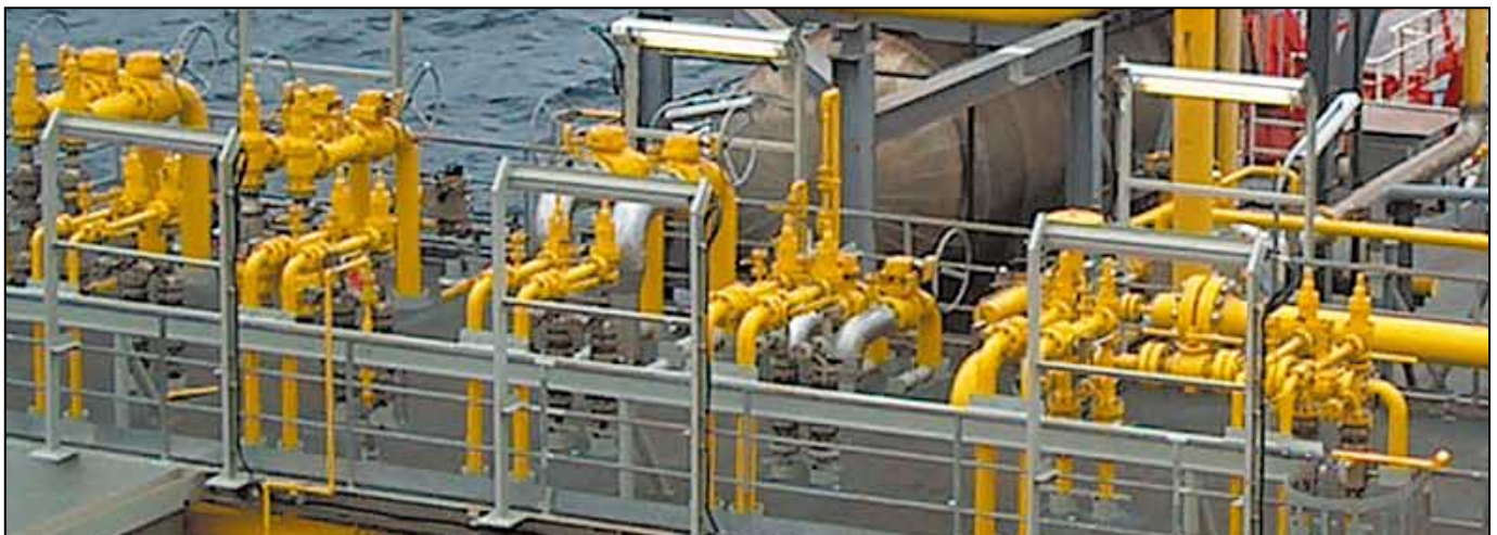
Typical offshore installation.